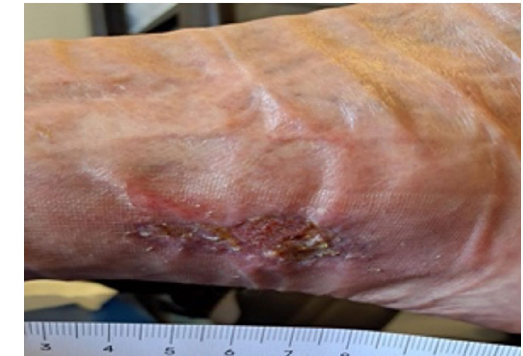
Figure 5. Day 7