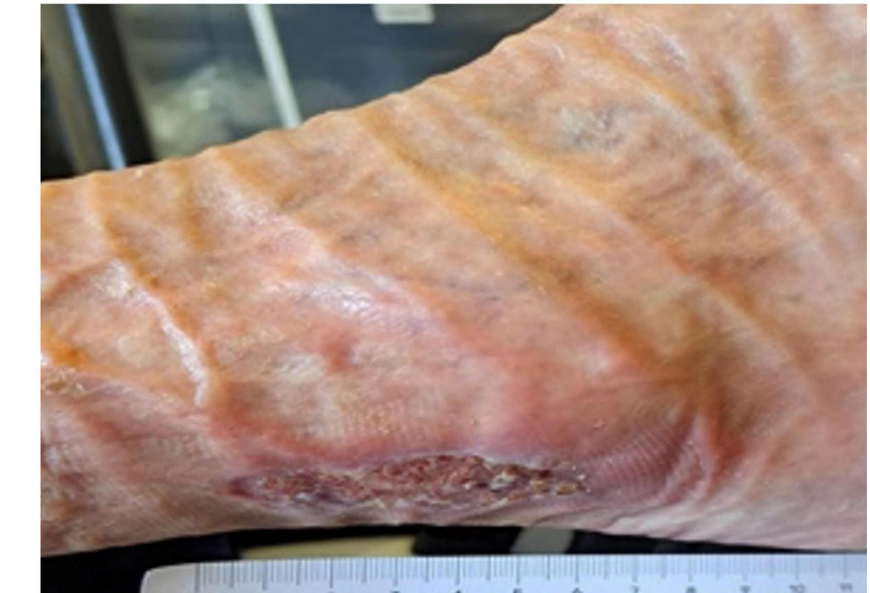
Figure 4. Day 0

EST stimulates cellular activity in the wound bed, enhancing endogenous healing processes. In this patient, relief from wound-related pain improved his quality of life (sleep, mobility) and tolerance of standard wound care (including cleansing, debridement and compression), cumulatively supporting rapid healing. In this case, 12 days of sub-sensory EST was associated with rapid healing of a painful VLU, improved pain control, and enhanced patient quality of life. The clinical team described the effect as transformative for this patient, and the patient was "absolutely delighted" that his ulcer had healed.