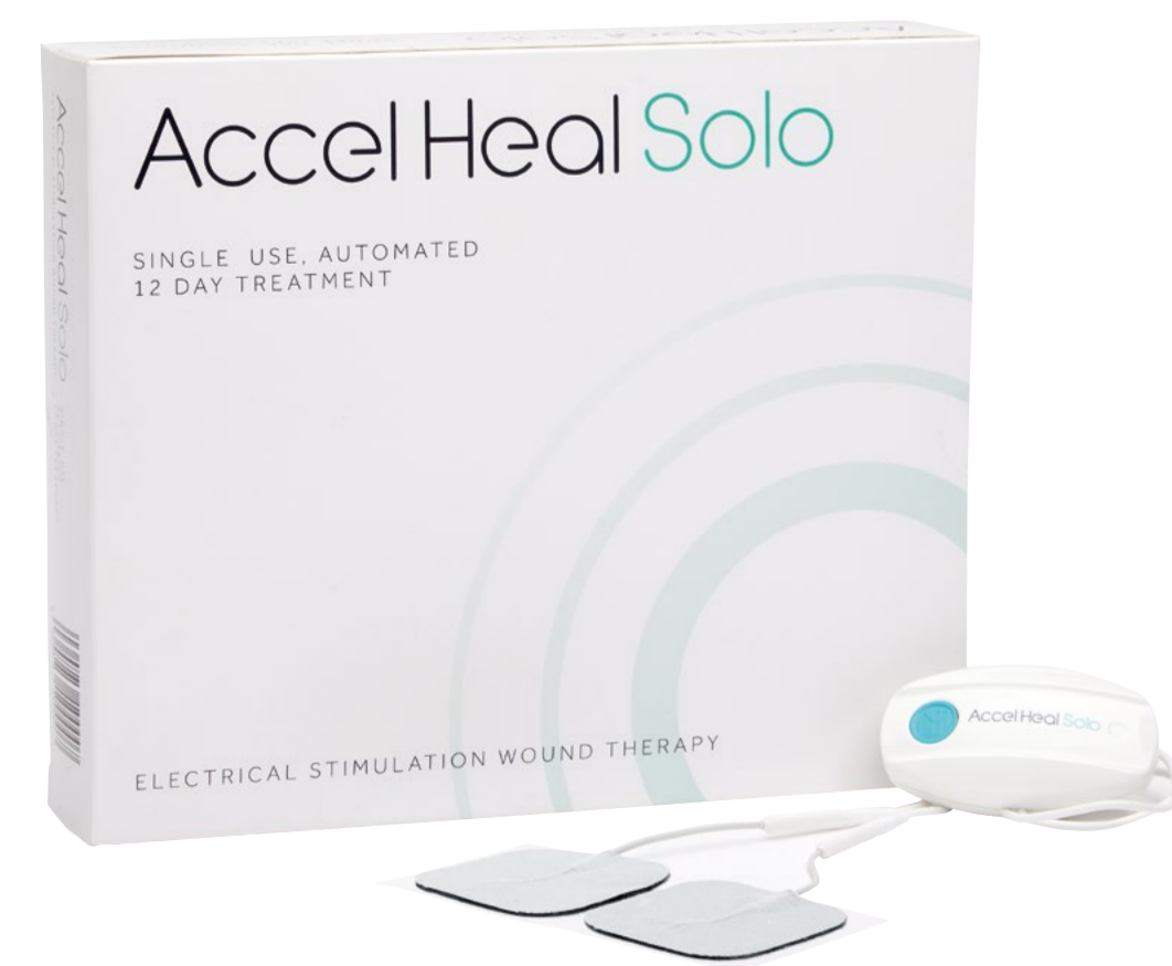
Figure 1. Accel-Heal Solo

A wearable, single use, sub-sensory EST device* (see figure 1) was applied alongside standard care including therapeutic compression therapy for a single patient for the recommended 12-day treatment period. Wound dimensions and wound pain (visual analogue score [VAS, 0= no pain-10= worst pain]) were monitored. Informed consent was obtained prior to application of the EST device*.