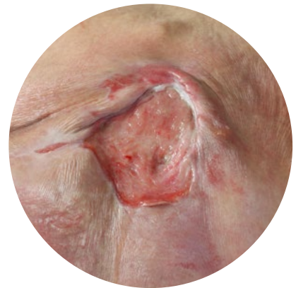
Pressure ulcers (PUs)

The device can be applied by a healthcare professional or by patients/carers with guidance and training.