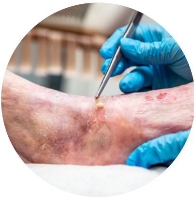
Diabetic foot ulcers (DFUs)