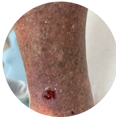
Venous leg ulcers (VLUs)