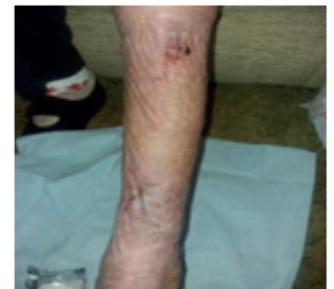
Wound healed within 12 weeks of commencing Accel-Heal