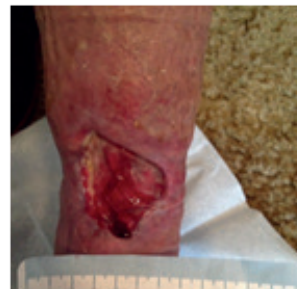
Day 0 prior to Accel-Heal treatment